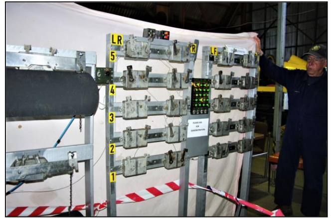
This photo illustrates the bomb release shackles and sequence release lights.

When visiting the hangar, please request a demonstration of this example of 1940s technology.