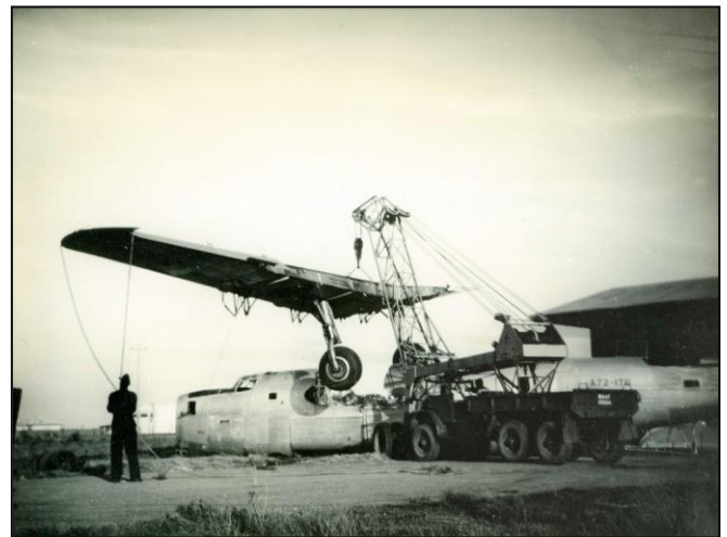
The second photo is of our aircraft taken in 1948. Another bit of history!!!!!!