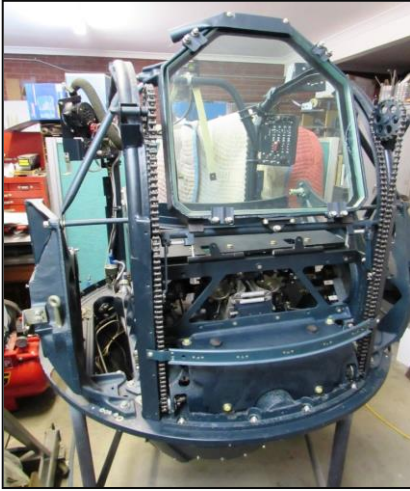
Front turret 2

Work is continuing off-site on front turrets 2 and 3 plus the manufacture of nose undercarriage door location items. Steady progress is being made.