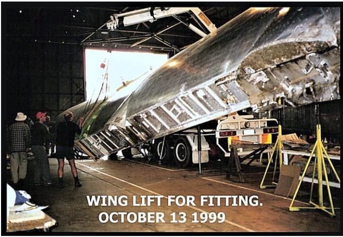
WING LIFT FOR FITTING. OCTOBER 13 1999