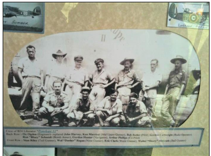
Crew of 'Penelope II': (A72-58 of 21 Sqn)