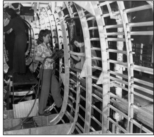
Lady riveters at work on the port side of a Liberator rear fuselage at Willow Run during 1944

Lady riveting teams were crucial in the production cycle of aircraft assembly during World War II.