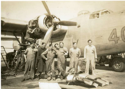
Servicing crew on A72-40 at Tocumwal