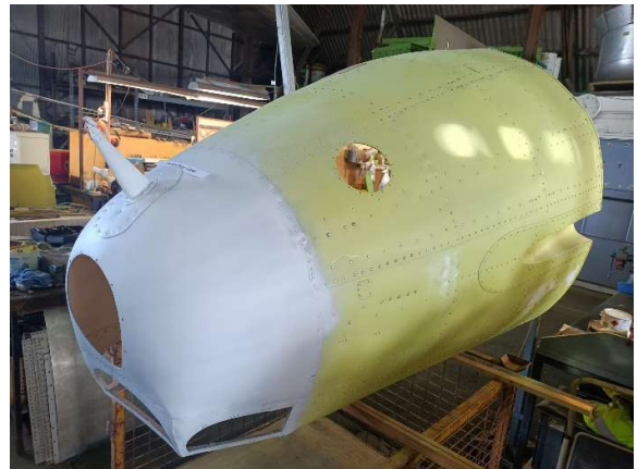
The Avro Anson nose cone and stand for work on undercarriage oleo legs

Both undercarriages and engine frames have been mounted on new higher, movable stands which show the full extension of the undercarriage oleo legs with wheels and tyres fitted. Both support frames have been painted bright yellow so they do not create a hazard. The frames have been fitted with timber flooring to enable work on the engine and undercarriage to continue without safety issues.