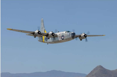
A PB-4Y-2 Privateer, a B-24 Liberator spin off