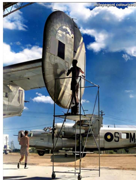
B-24 Liberator from 21 Squadron RAAF being serviced at RAAF Darwin in 1945. (Note: colourised photograph)