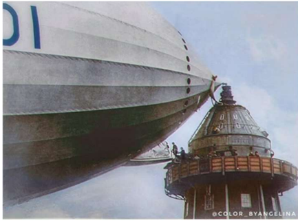
R101 airship loading passengers