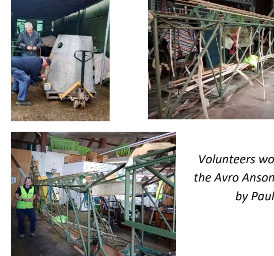
Volunteers working on the Avro Anson

The Anson restoration is progressing at speed, thanks especially to volunteers who came from Point Cook. They are great team players and have fitted in well. Recent work has included the turret entry door and bulkhead, and assembly of the first undercarriage. The sandblasting room is in use every day and is proving a great asset to the restoration.