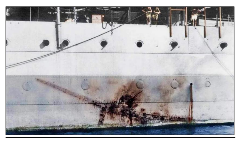
The imprint of a Japanese light float plane plane (two crew) on the hull of HMS Sussex, Pacific Ocean, 1945

Because the early Bofors anti-aircraft guns fitted ships could not traverse below the horizon, it was believed that it was safe to attack ships at low level.