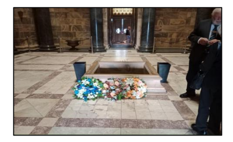
Floral tributes were laid.

Our annual B-24 Liberator service was held at the Shrine of Melbourne on 23 March.