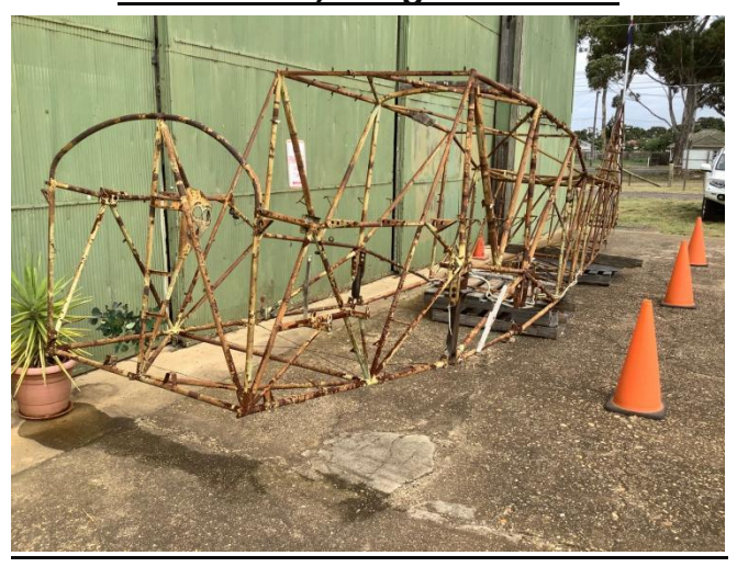
As received January 2021