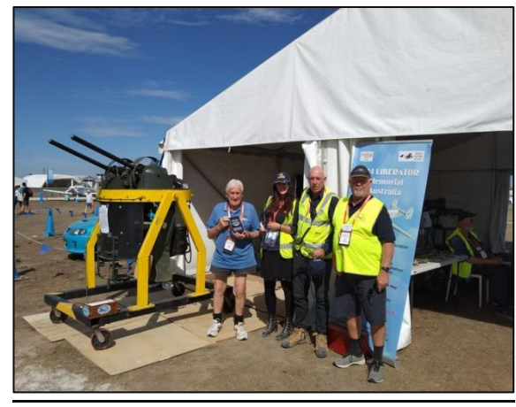
B-24 Liberator, hangar activities

Our Exhibition at the Avalon Airshow was well patronized, and the working Liberator