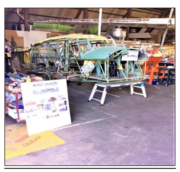
As at April 2023

An Open Day and welcome to our Anson project will be held at the hangar on Sunday 7 May from 9.30am to 1.30pm.